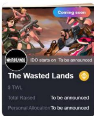
The Wasted Lands / Twitter